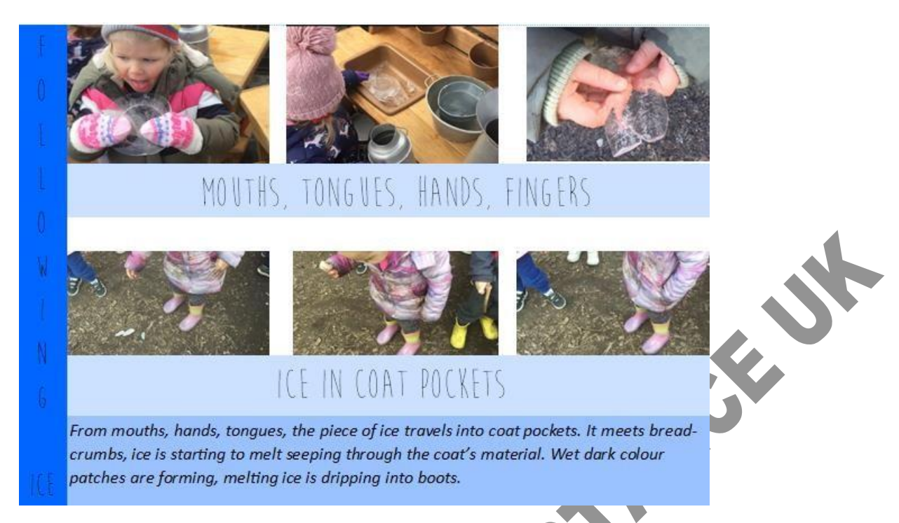
Figure 5. Staying with ice, staying with trouble. Screenshots from Author's videos. Excerpt from journal entry 18/02/21.