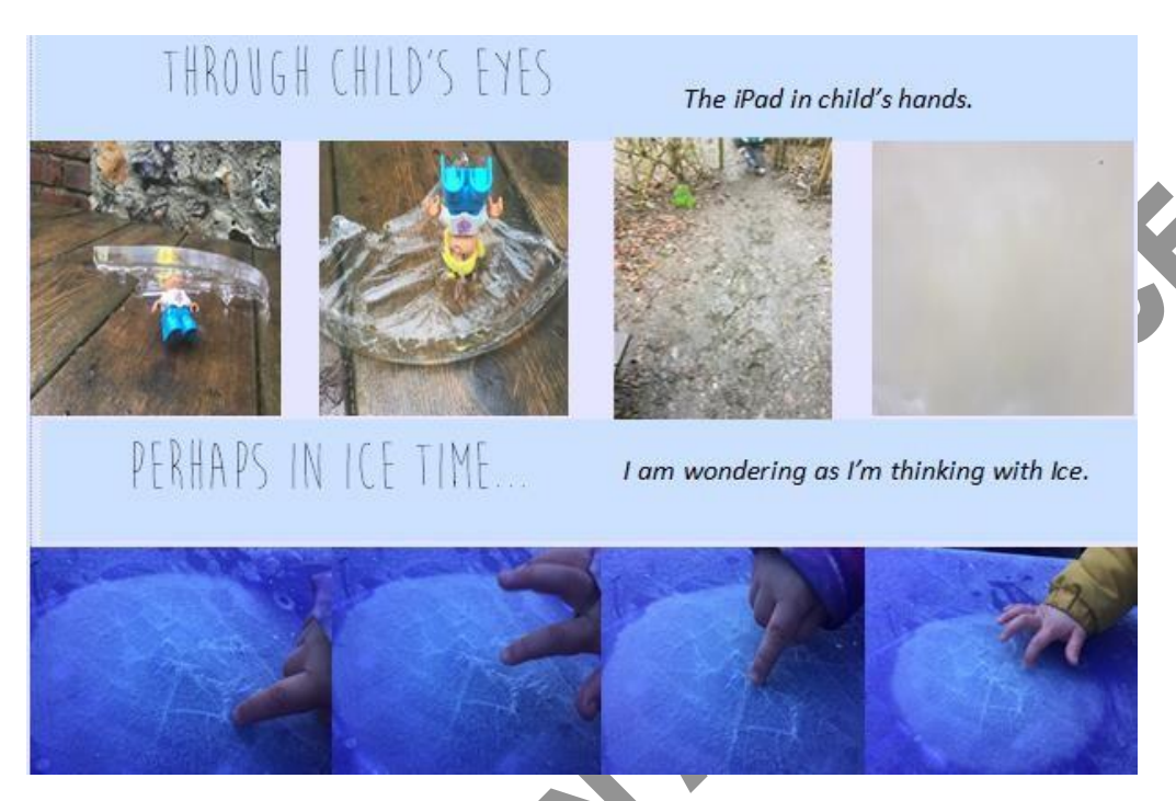
Figure 6. Child /camera/ ice in ice time.

Top: Photos and screenshots of videos from 25/02/21 session. Children authors unknown.