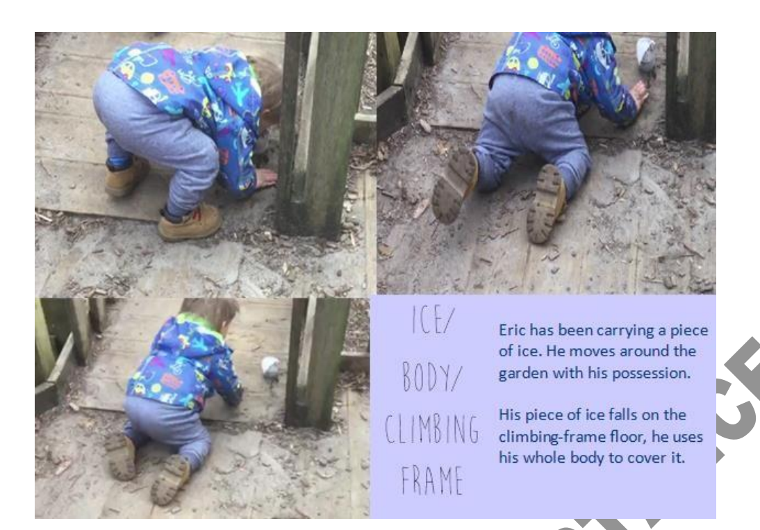
Figure 3. Ice/ body/climbing frame assemblage. Screenshots from Author's video. Journal Entry 4/02/21.

The two excerpts above (journal entry 4/02/21 in appendix A; Eric/ice/climbing frame transcription in appendix B) and the pedagogical documentation (figure 3) shows the intensity and energies that ice has afforded in relationship to children like Eric and practitioners who discuss on how to approach the children licking ice. Eric is almost 2 years old in the video where he engages with ice. His is only beginning to name things, therefore language here is only one language among many. I am fascinated how I can read his other languages, communicated between him and ice, also how he communicates through his body.