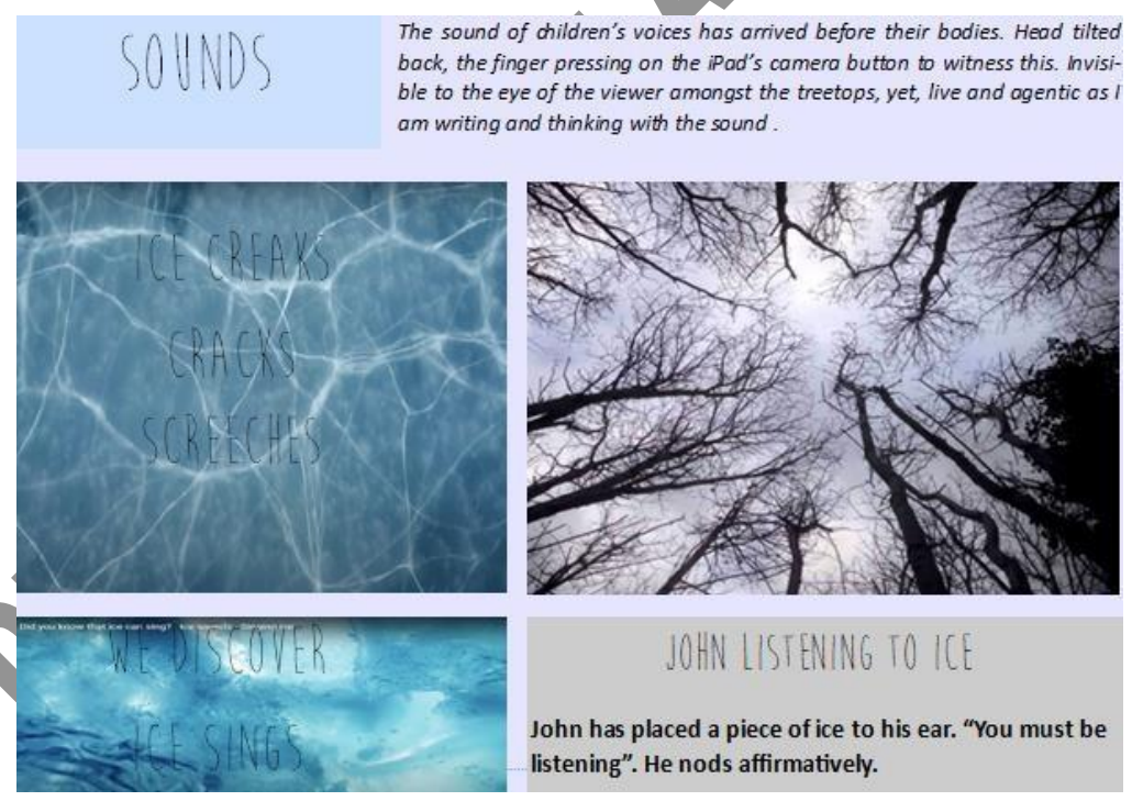
Figure 4. Sound entangles. Sound of ice as affect.

Left- screenshots from Youtube video. Top right- Author's photo. Top right- excerpt from journal entry 11/02/21. Bottom right-excerpt from transcription "John listening".