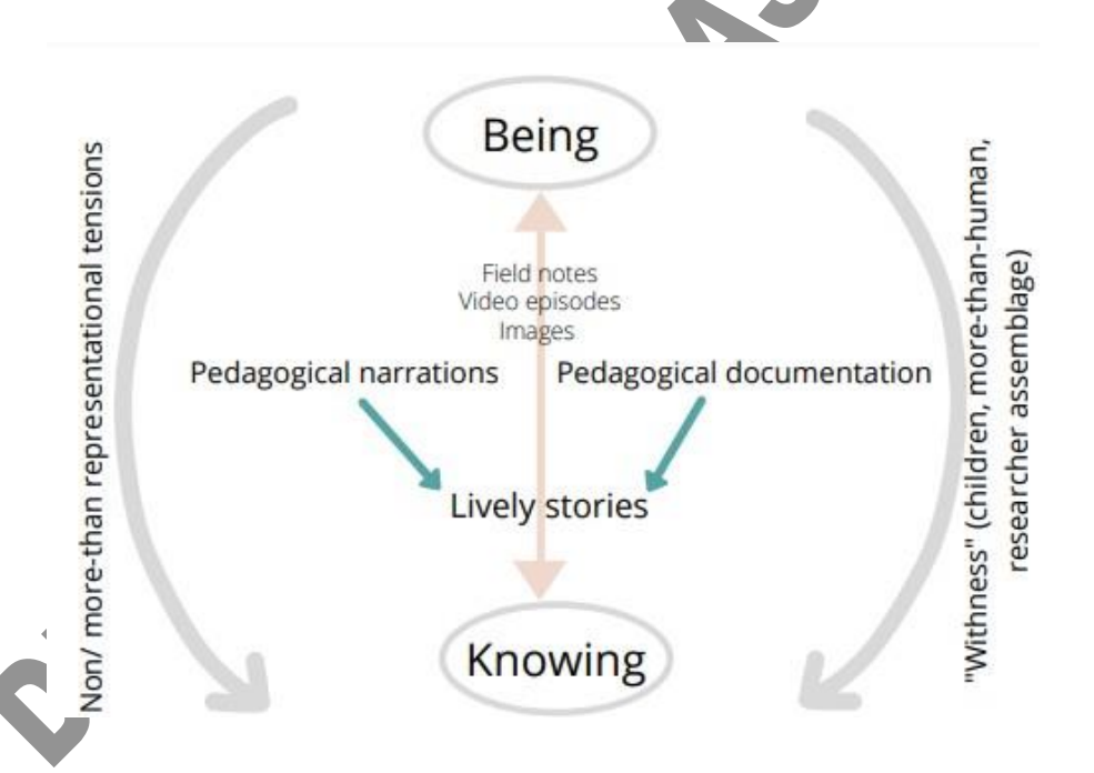
Figure 1. Knowing in being.

learning with ice (the more-than-human) visible, also affording a collaborative space for thinking with children. Importantly, the researcher is not situated outside of experiences, but is entangled with layers of complexity, therefore affording thinking, questioning, and interpreting as well as engage with multiple meanings (lorio et al., 2018). Traces of happenings, everyday moments, conversational exchanges, noticings and wonderings in the form of pedagogical documentation became well suited to be shared with children, teachers and families. Pedagogical documentation also served as a creative way to present findings of this study in Chapter 4, as Osgood and Giugni (2015) encourage to consider visual representations, not privileging textual ones among other mediums. Iorio et al. (2018) acknowledge that it also illustrates the relationships children develop with more-than- human, creates collaborative spaces to revisit experiences and expand questions. Pedagogical documentation is seen as an instrument of reflection, interpretation and revisiting of encounters. Additionally, video, images, notes generated through individual and group experience collectively contribute towards knowledge creating process (lorio et al, 2018).