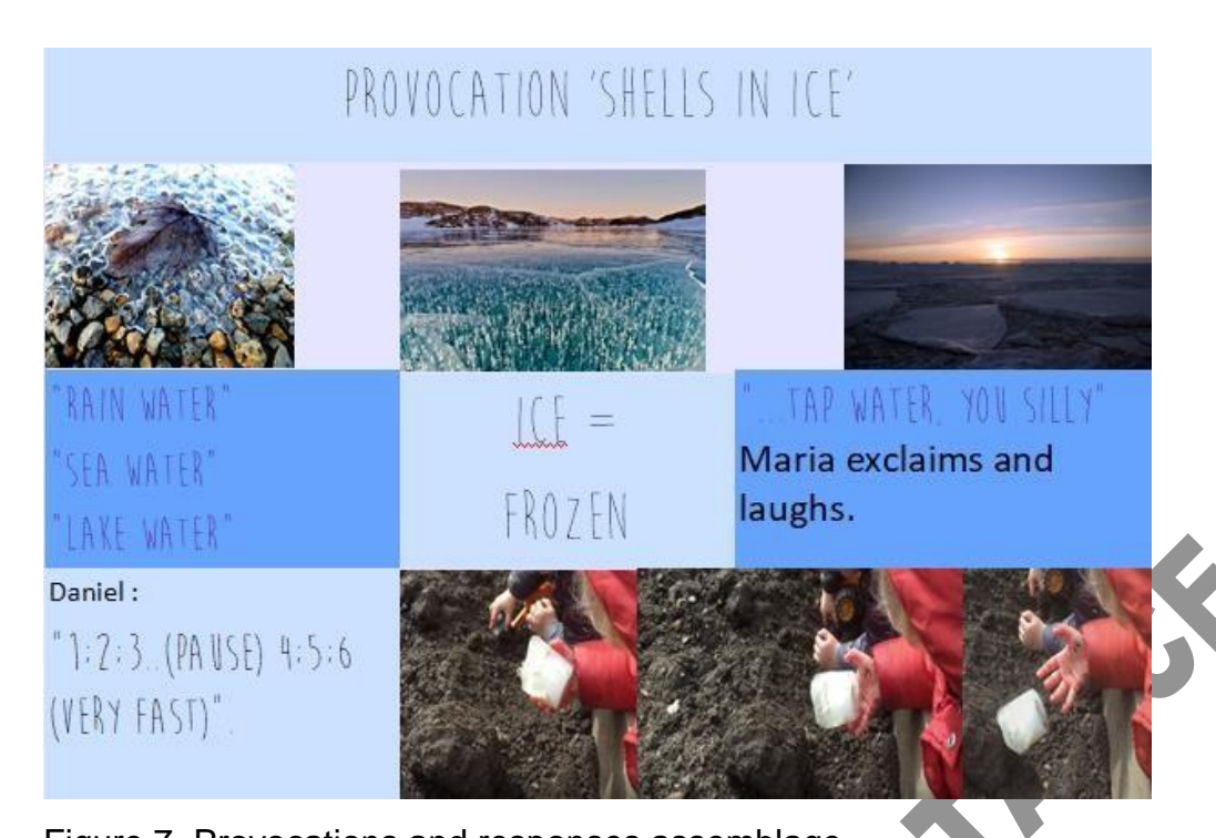
Figure 7. Provocations and responses assemblage. Excerpts from transcriptions Dripping and Dropping, Journal Entry 8/04/21.

Although I came to this research to learn with and from the children, from with(in) their entanglements, during one of the sessions I brought in provocations. During provocation with ice morning, I noticed Daniel leaning over the side of the vegetable bed, holding his piece of ice over the freshly dug up soil, really concentrating, keeping his body still until ice fell out of his hand. Whilst I was lingering over and over the video, a barely noticeable, child's voice appeared. Daniel is counting: "1;2;3..(pause) 4;5;6 (very fast)" (transcribed video: Dripping and Dropping). Of course, he must be counting the water drips!